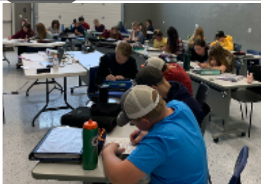
The Grade 10 class has been using the Multipurpose room in the church building for their classes. There are 27 students in grade 10 this year!

At TCHS, we strive to offer quality education in a variety of courses. Grade 10 courses this semester include Christian Studies 15; PE 10; Science 10 and 14; and Math 10C, 10-3, and Math 10-4. Grade 11 courses have included PE 20; English 20 and 20-2; Social Studies 20 and 20-2; Physics 20; and Science 24. We have also offered a variety of options courses, including Foods, Construction, Psychology, Spanish, Health Foundations and Sketch, draw and design .