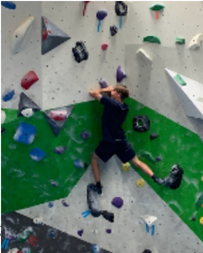
(Left) The PE 20 class has been able to have two bouldering sessions at Coulee Climbing in Lethbridge. This class will also be participating in Swimming, Curling and Taekwondo.

In all that we teach, we strive to view concepts through a Christian lens, and consider how we can use our learning to serve our communities and steward God's creation.