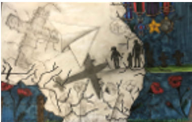
(Left) Remembrance Day Poster Entries for the Royal Canadian Legion.